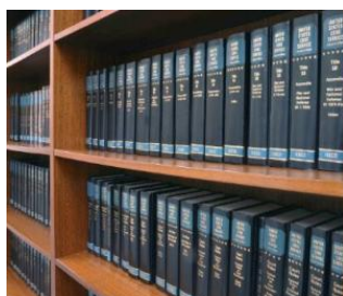
PRINTERS' INK, VOLUME 6, ISSUE 1...